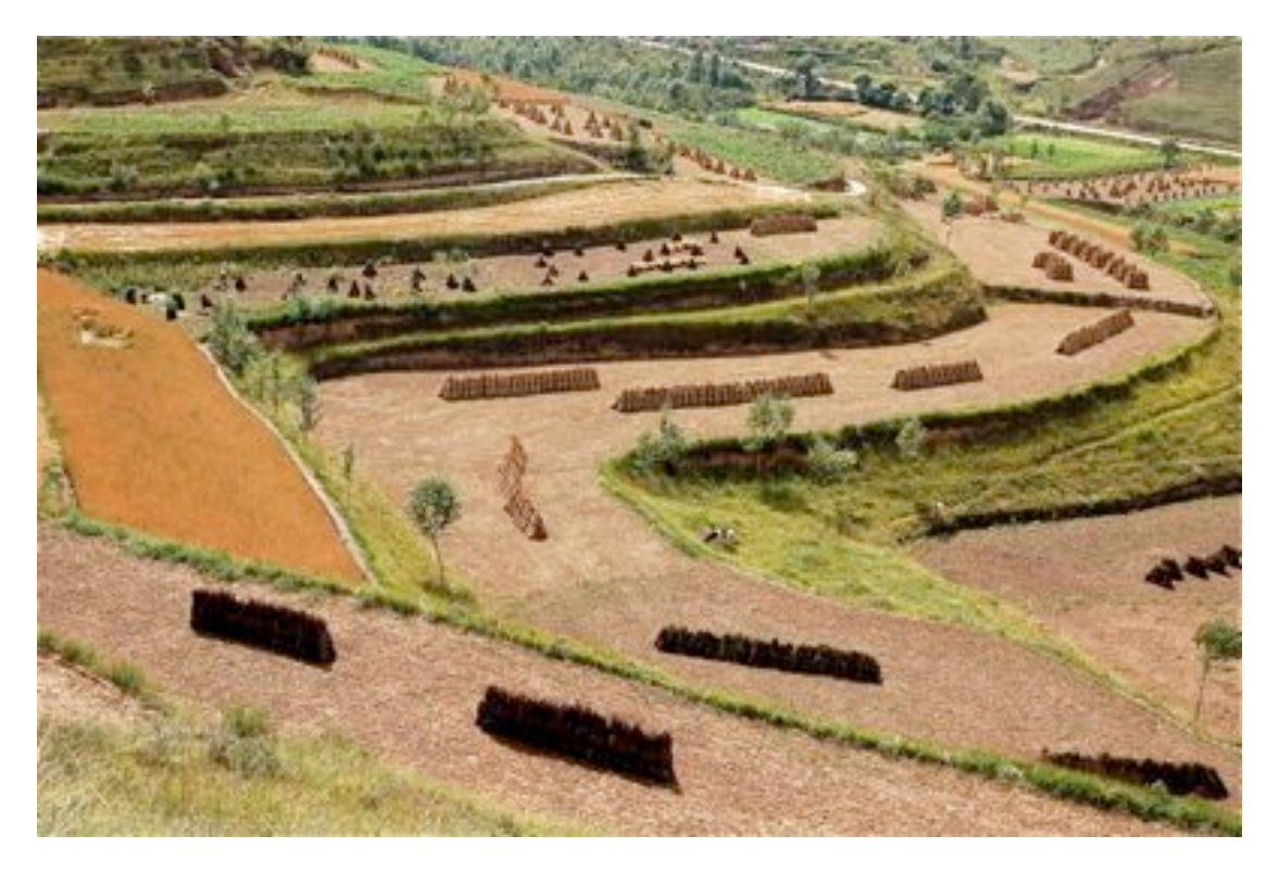
Plate 1. Spring wheat and other crops are grown in terraced fields in the mountain villages of Huang Zhong county, Qinghai China

Ian will return to Australia in late January, charged with memorable professional and cultural experiences, but needs to find a role for the future. The MLA-funded work on pasture soil biology in SARDI has concluded, not for lack of quality progress but as a consequence of the tightening of rural research funding associated with the extended drought in much of Australia.